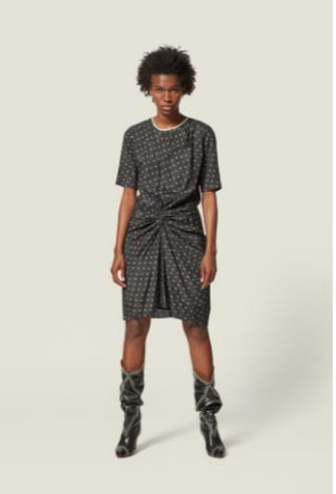
If it's possible, how?